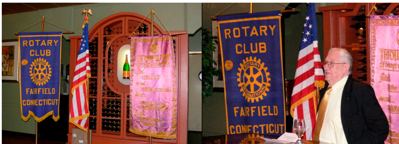
PolioPlus Luncheon: 01/25/10 @ The Fairfield Café THANK YOU Iso, owner of The Fairfield Cafe

Visit the Rotary International Website at: http://www.rotary.org